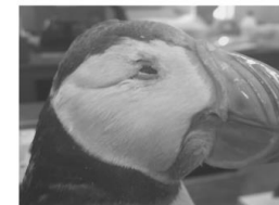
Scratched or receding eyes