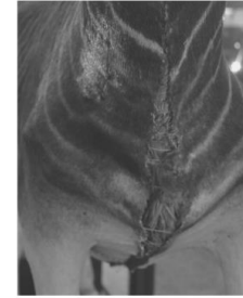
Skin Splitting at seams