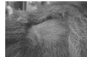
Fur or feather loss