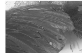
Dirt, dust and damage from pests