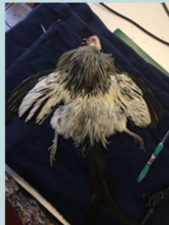
Before and after drying briefly with a low-heat hairdryer